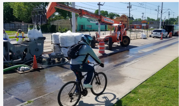
Vortex was able to rehabilitate the 60" sanitary sewer line running beneath a section of the City's light rail train tracks.