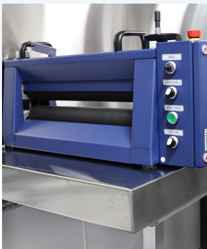
E-Roller with grip coated brushless rollers, digital counter and foot pedal controller