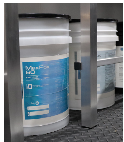
Under counter, secure storage space for resin