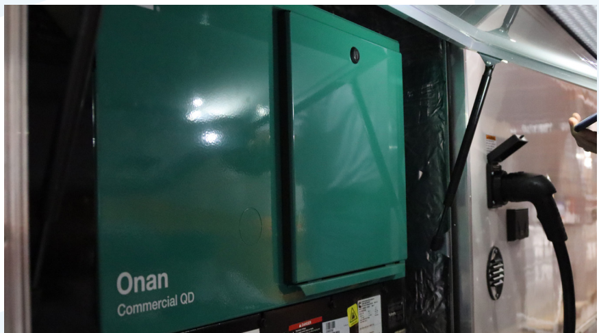
Commercial grade Cummins® ONAN generator