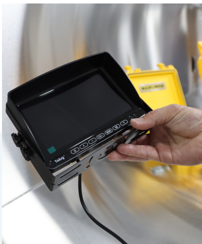
Mountable back-up camera