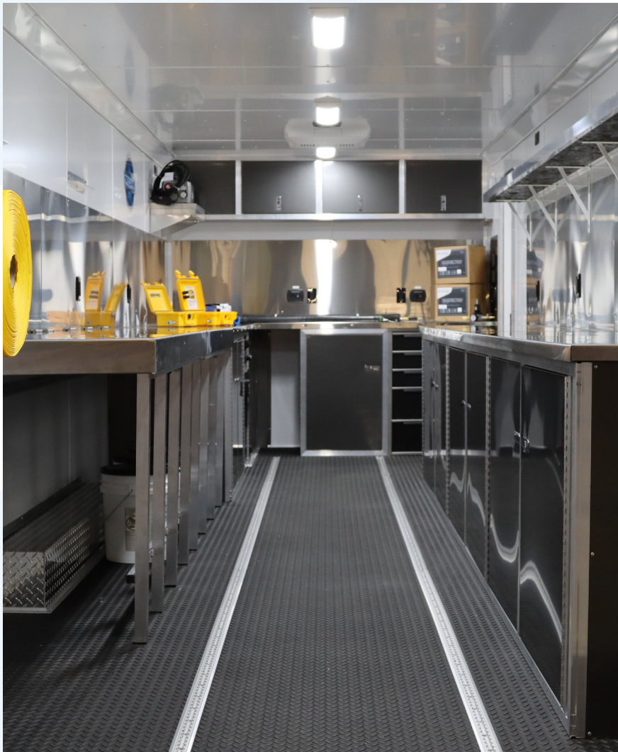
Non-slip flooring, built-in AC and plenty of LED lighting