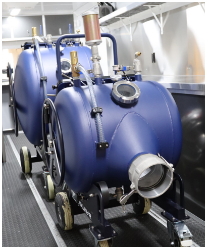
Built in tie-downs to lock down your drums