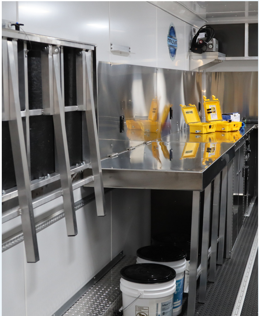
Hinged counters provide more storage and hauling space