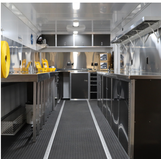
Plenty of storage and counter space for prep and lining

Delivering proven lateral and vertical pipe rehabilitation products and equipment for more than 20 years , the MaxLiner Small diameter CIPP Lining Trailer is the latest addition to the extensive line-up of MaxLiner equipment. Choose from a 18', 20' or 24' trailer custom-built and MAX'd out to your specifications.