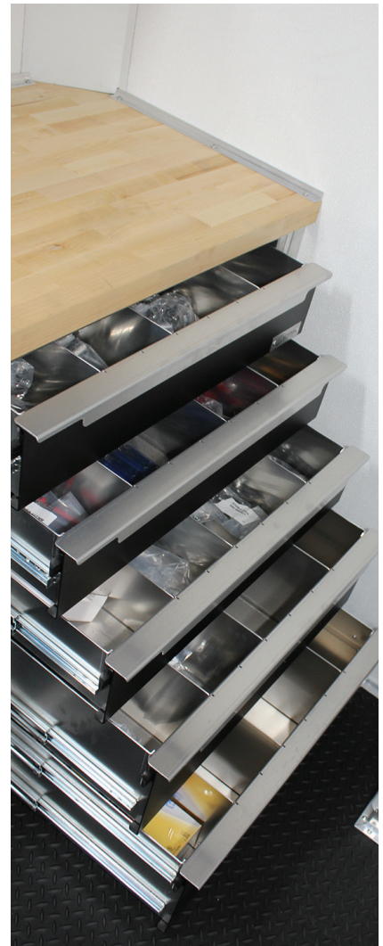
Plenty of drawer space for 655 piece tool set