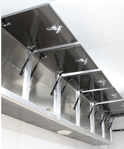
Ample overhead storage with locking cabinets