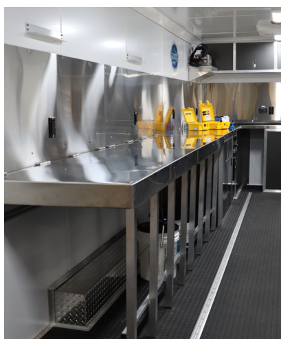
Stainless steel surface for easy clean-up